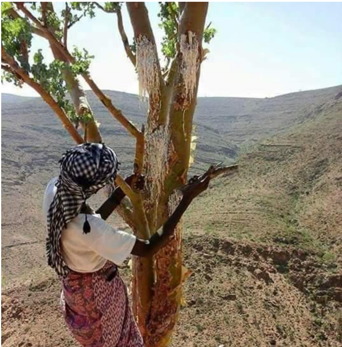
Yield processes of Frankincense tree

Frankincense and myrrh gums production remains until today an import economic source and a major livelihood sector for the pastoralist and coastal communities of Bari Region of Puntland, who harvest these resins/gums. The gums categorize to various species. Frankincense types include: 'Maydi' gum/resin exploited from Yag'ar tree (botanical name: Boswellia Frereana ), and 'Beeyo' gum extracted from Mohor Tree (botanical name: Boswellia Sacra ). Both types of frankincense gums are cultivated annually by successive tapping of the respective trees (see below). 'Maydi' gum is often tapped from August to the harvesting period of April-June, while 'Beeyo' is tapped in the hot reason from March to August. Myrrh gums, which are commonly associated with frankincense gums, are obtained from Commiphora Myrrha tree and produced for similar purposes.