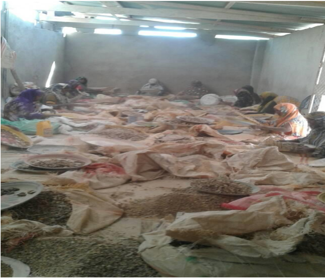
First Processing after Yield