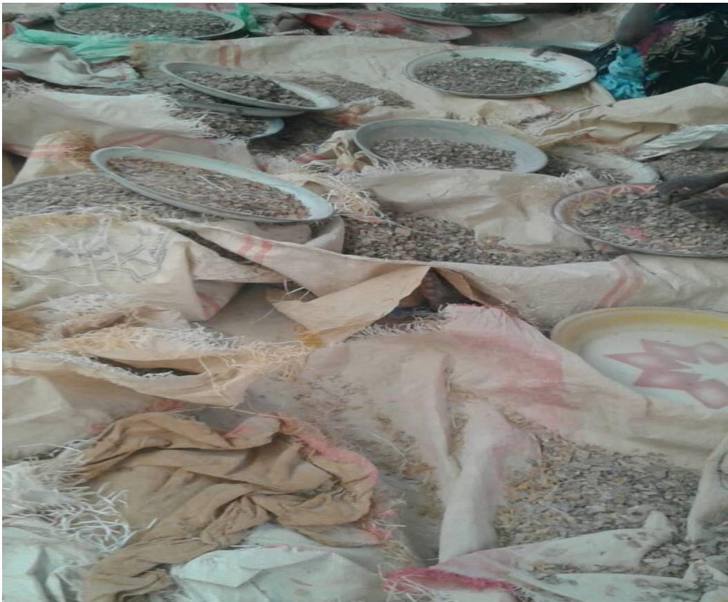
First Processing after Yield